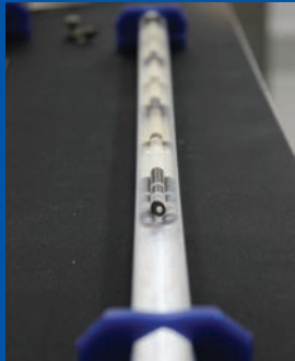
Lens system on a rail